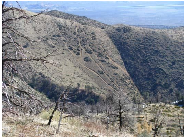
Unauthorized hill climb damage visible from the Pacific Crest Trail, Kern County CA

California's OHV Program was last reauthorized 10 years ago. Over the past decade, it has become clear that the next reauthorization of the program would need to include improved natural resource management techniques, improved oversight of the program by the Department, and increased funding for projects that repair lands damaged from motorized recreation. Senator Allen introduced SB 249 to do just that.