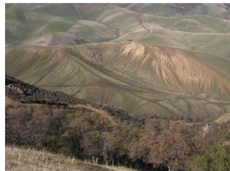
Nearby Carnegie SVRA – a view of Tesla's fate.