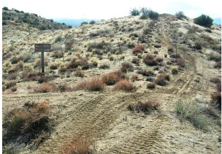
Above: Illegal riders flagrantly disregard restoration and protected wilderness areas. (Juniper Flats in San Bernardino County).

Left: Vertical hill climbs create dangerous instability, erosion, and permanent environmental degradation. State Vehicle Recreation Areas (SVRAs) and other OHV riding areas use best management practices (BMPs), but BMPs do not eliminate environmental impacts and are not mitigation measures. Damage from OHV use is continuous and repeated.